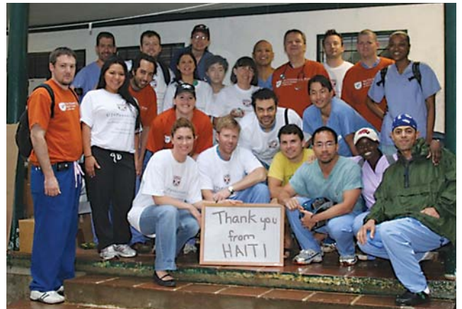
The Haiti Ortho team

The Texas Medical Center group used about half the funds they raised for the trip. The remainder will be used for future support, including