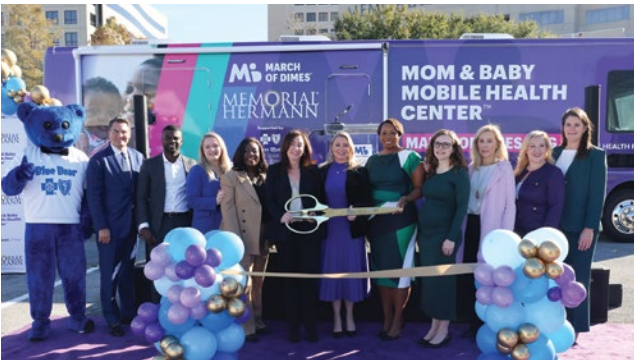
Representatives from Memorial Hermann, Blue Cross and Blue Shield of Texas and March of Dimes celebrate the ribbon cutting of the Mom & Baby Mobile Health Center®.