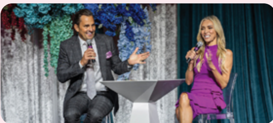
Bill and Giuliana Rancic shared their story of Giuliana's breast cancer journey with humor, humility, and words of wisdom for anyone facing cancer or someone who is supporting them.